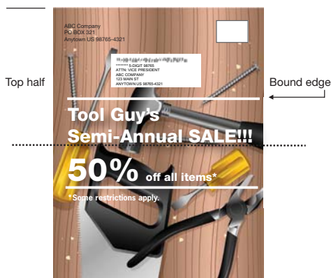
Catalog addressed on back cover. “Top” is the upper edge when the spine is on the right.

You can place the delivery address on the front or the back of the mailpiece, but it must be on the same side as the postage. The address may be parallel or perpendicular to the top edge, but not upside-down as read in relation to the top edge. A perpendicular address can face to the left or the right.